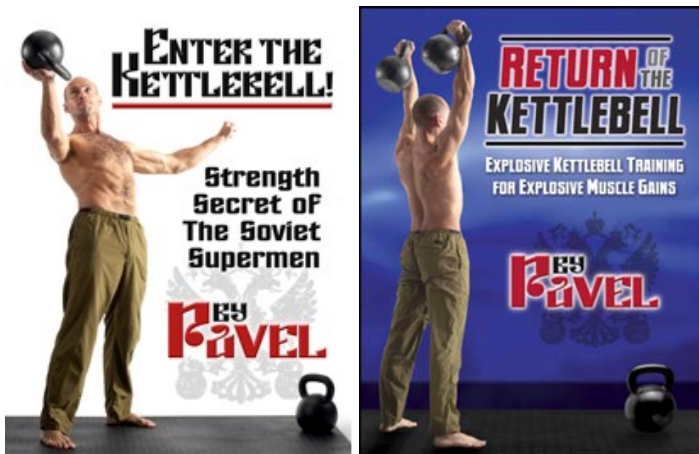
Enter the Kettlebell!